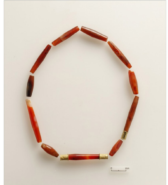
Necklace Made of Gold and Onyx Stone Early Bronze Age