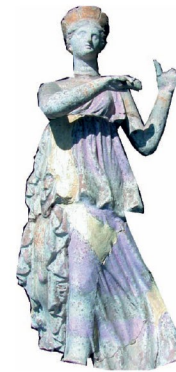
Dancing Woman figure from the Hellenistic Period found in the excavations in Myrina (Güzelbahçe)

The first research efforts in Bergama, one of the earliest discovered ancient cities among the archaeological settlements in Anatolia, began in 1865. A small warehouse museum was created in the garden of the excavation house in order to protect the artifacts unearthed by C. Humann and A. Conze between 1878 and 1886. In addition to the excavations carried out in the Acropolis, a new museum building was needed as a result of the increase in the works unearthed as a result of the excavation activities in Asclepeion. In 1924, some of the archaeological artifacts were transferred to the building which was used as people's house in the city center in 1934 and began to be exhibited. Marshal Fevzi Çakmak, who came to Bergama in 1932, gave instructions for the establishment of a museum. Inspired by architects Bruno Meyer and Harold Hanson from the plan of the Altar of Zeus, the foundation of the museum was laid in 1933 in its current place, which was previously a cemetery. The museum was completed and opened to visitors on October 30, 1936.