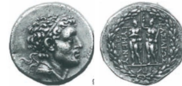
II. Eumenes; Tetradrachmon 180-175 BC