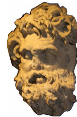
Pergamon Figurine Baroque style Hellenistic head belonging to Pergamon Sculpture School (2nd century BC)

Its aesthetic posture and dynamism are highly compatible with the folds of the dress and the facial expression is very realistic. The figure, which has been successfully shaped forward, is also important in terms of being painted.